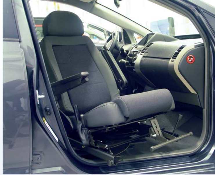
Tilda in position 3 and in combination with the TURNOUT swivel base, with the Carony rails mounted on the sides. The footrest is an option.

Maximum user weight: 150 kg. Height, under the seat: 24 mm Width: 520 mm